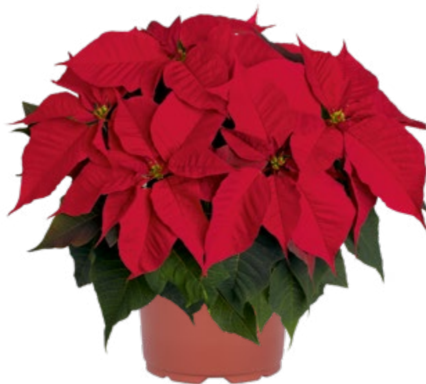
Bella Italia Red 10610