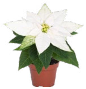
J'Adore White Pearl 10155 7 weeks