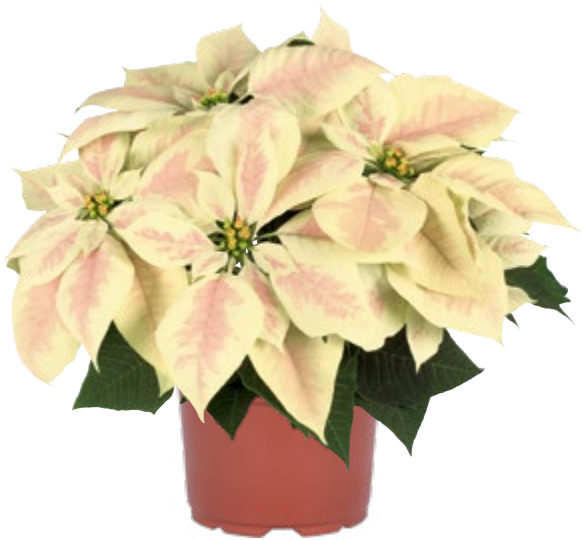
Premium Marble 10249 7 weeks