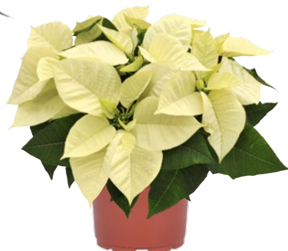
Premium Polar 10243 7.5 weeks