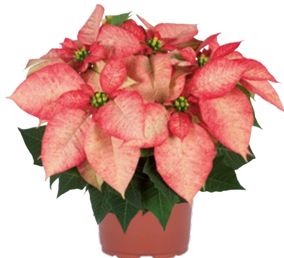
Premium Picasso 10234 7.5 weeks