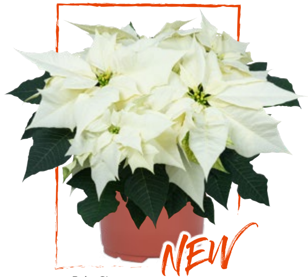
Polar Star 11051 8.5 weeks