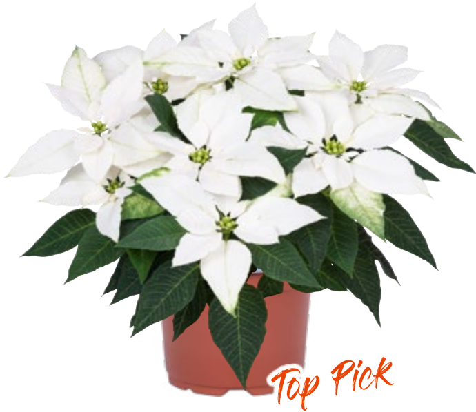
J'Adore White Pearl 10155 7 weeks