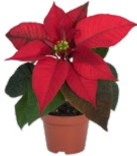
Odin 10149 8.5 weeks