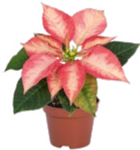
Premium Ice Crystal 10244 7.5 weeks