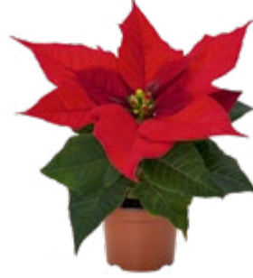
Scandic Early 2.0 10304 8 weeks