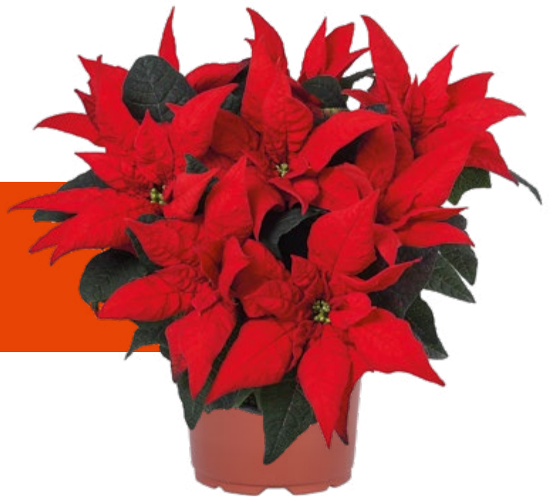
Winter Rose® Early Red 10993 7.5 - 8 weeks