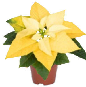
Golden Glo 11431 7.5-8 weeks