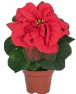
Winter Rose® Early Red 10993 7.5-8 weeks