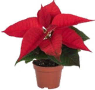
Imperial Red 10143 8 weeks