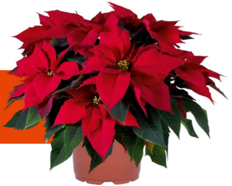
Primero Red 11310 8,5 weeks