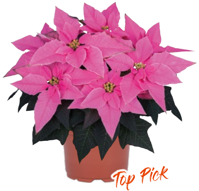
J'Adore Pink 10381 7 weeks