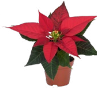
Embla 11420 8.5 weeks