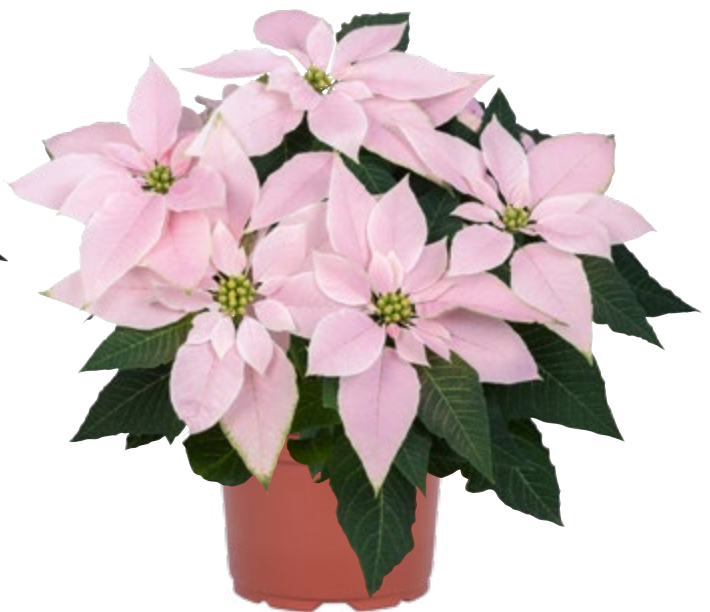
J'Adore Soft Pink 10156 7 weeks