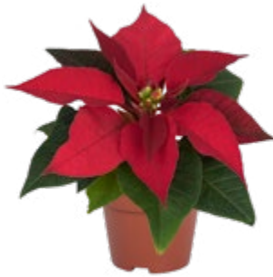
Prima Vera 10881 8 weeks