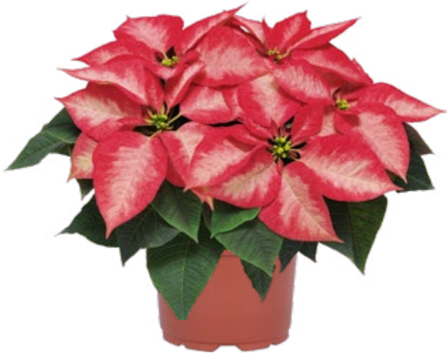
Premium Ice Crystal 10244 7.5 weeks