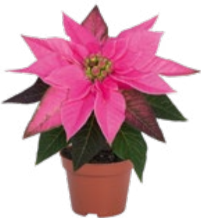
J'Adore Dark Pink 10154 7 weeks