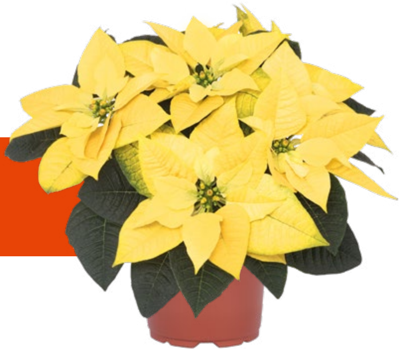
Autumn Leaves 11326 7.5 - 8 weeks