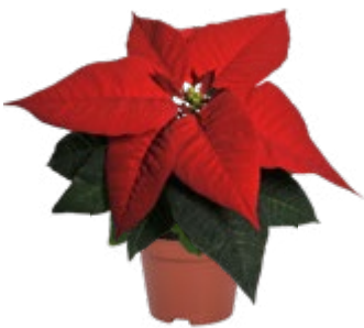
Premium Red 10230 7 weeks