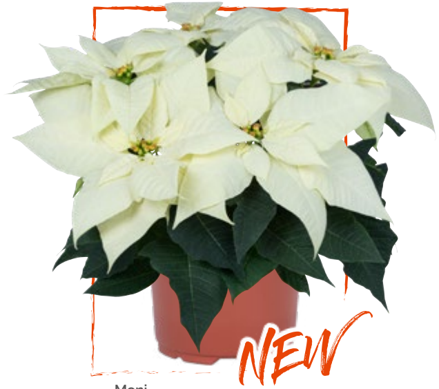
Moni 11094 7.5 - 8 weeks