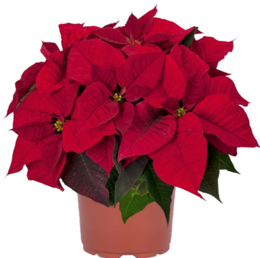
Overture Dark Red 10831 6 Weeks