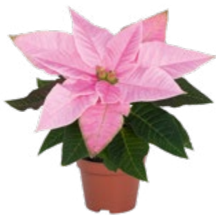
J'Adore Pink 10381 7 weeks