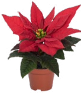
Jester Red 10994 7.5 weeks