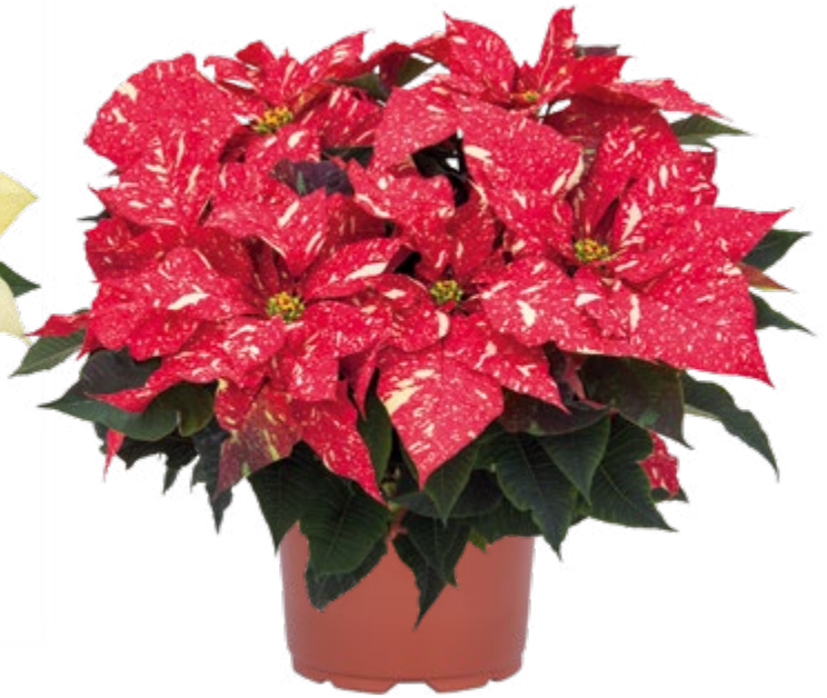
Primero Red Glitter 11317 8,5 weeks