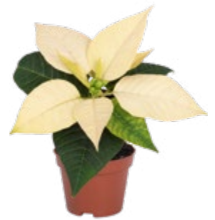
Premium Polar 10243 7.5 weeks