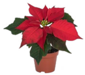
Redlight Bright Red 10182 8 weeks