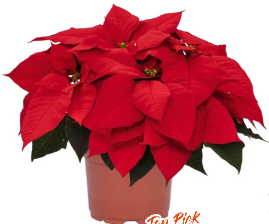
Premium Red 10230 7 weeks