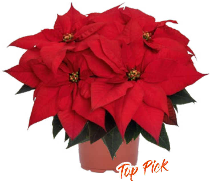
Ferrara 10897 8 weeks