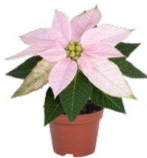
J'Adore Soft Pink 10156 7 weeks