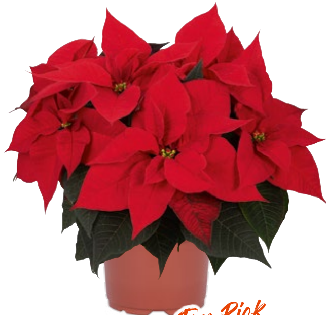
Imperial Red 10143