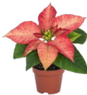
Premium Picasso 10234 7.5 weeks