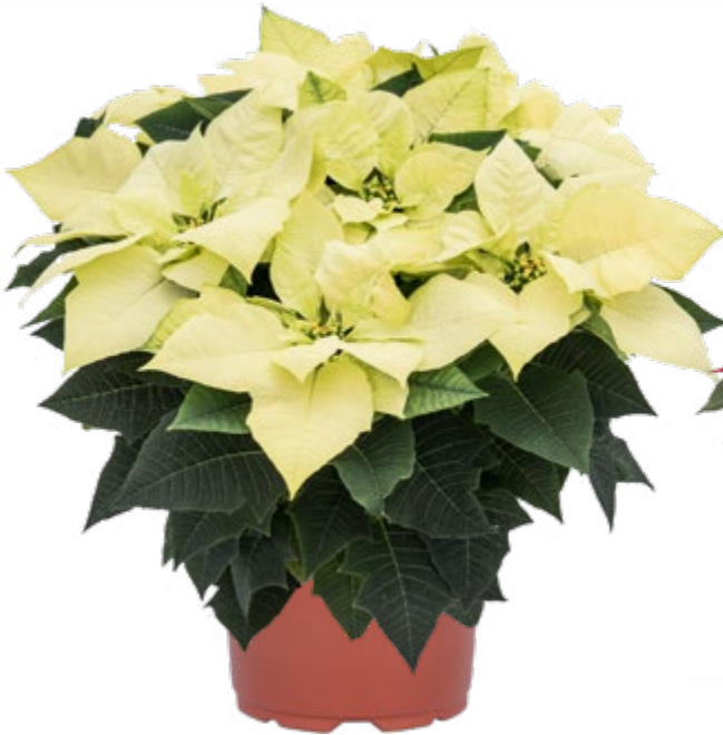
Primero White 11313 8,5 weeks