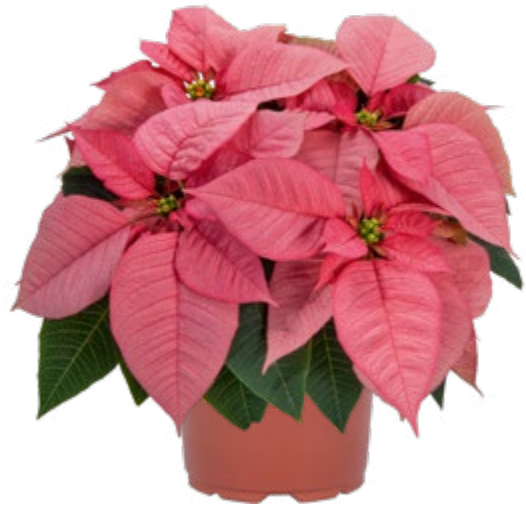
Premium Lipstick Pink 10235 7 weeks