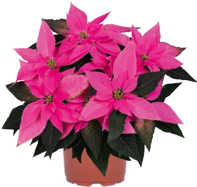
J'Adore Dark Pink 10154 7 weeks