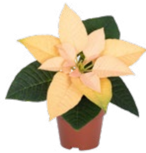
Autumn Leaves 11326 7.5-8 weeks