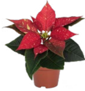
Matinee Glitter 10153 8 weeks