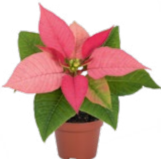
Premium Lipstick Pink 11423 7 weeks