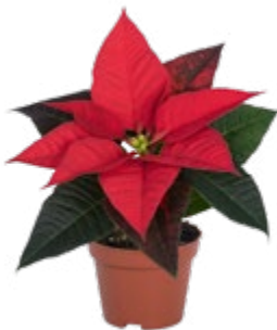
Freya 11421 7.5 weeks