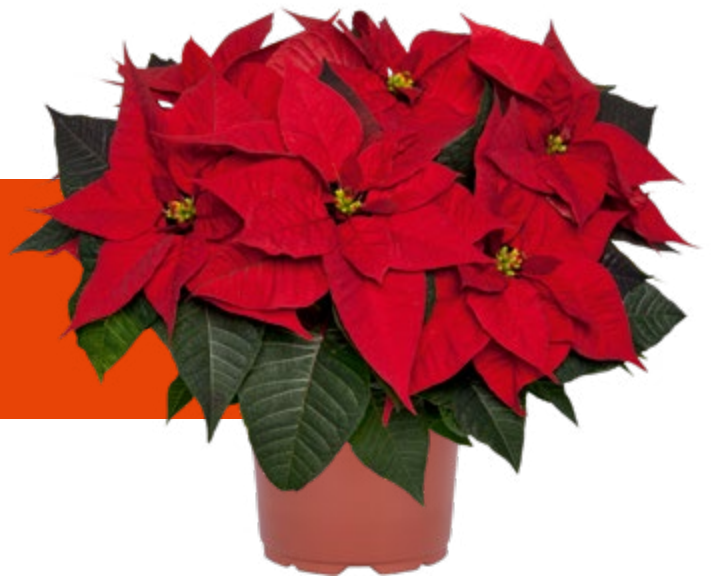
Bravo Bright Red 10360 7.5 weeks