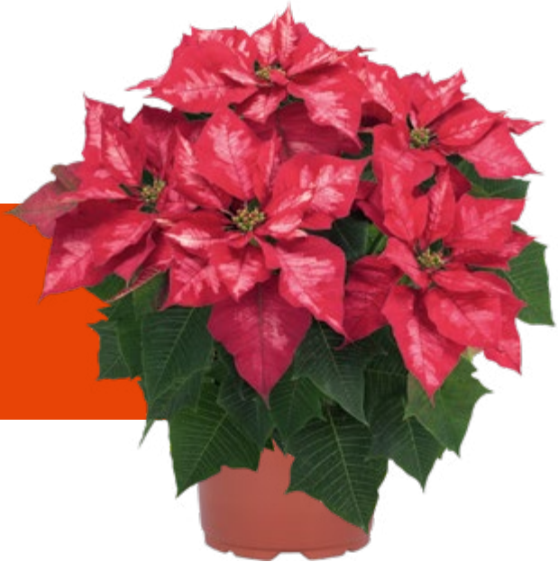
Early Polly's Pink 11055 8 weeks