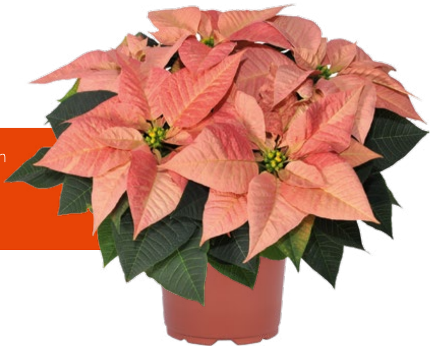
Matinee Glitter 10153 8 weeks