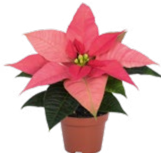
Freya Pink 11057 7.5 weeks