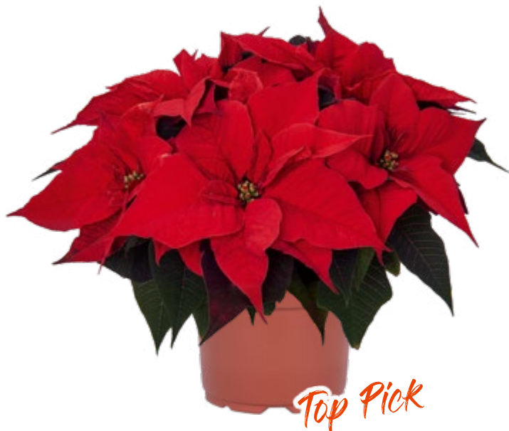
Grande Italia 10330 8 weeks