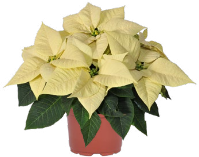
Premium White 10233 7 weeks