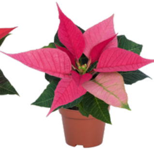
Embla Pink | 11101 8.5 weeks