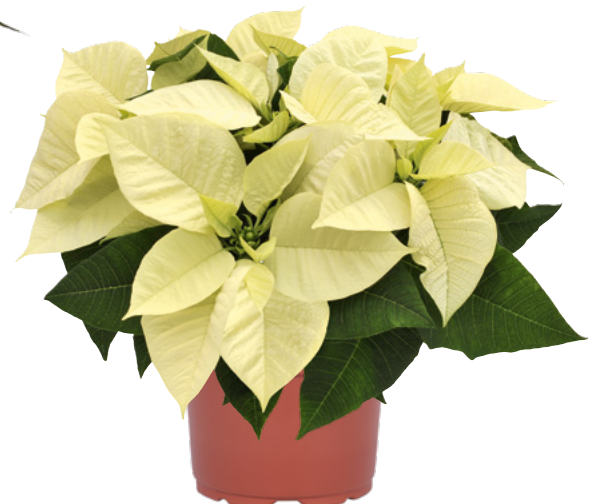
Premium Polar | 10243 7.5 weeks