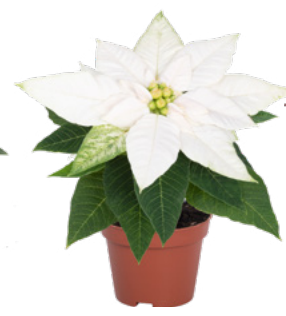
J'Adore White Pearl | 10155 7 weeks