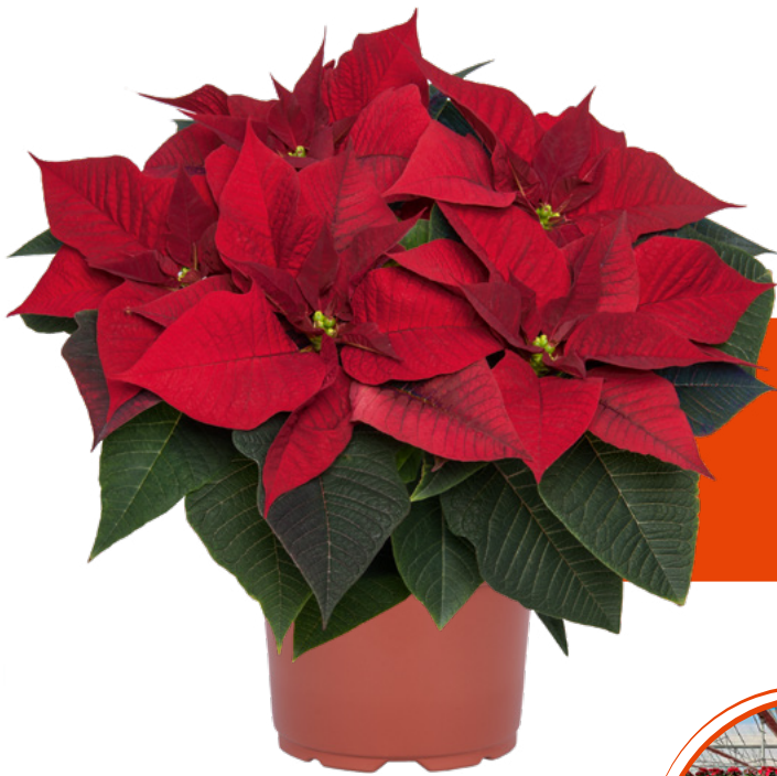
Antares | 10874 8,5 weeks