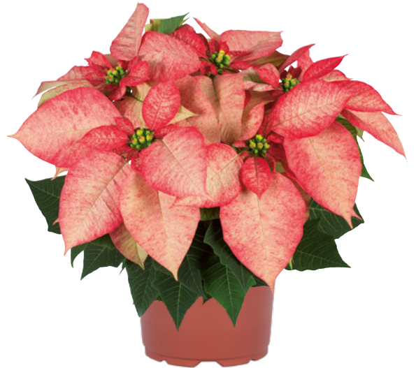
Premium Picasso | 10234 7.5 weeks