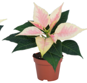
Embla Marble | 11120 8.5 weeks