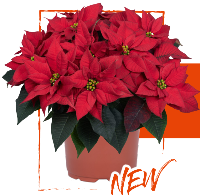
Rapid Red | 11121 6.5 Weeks