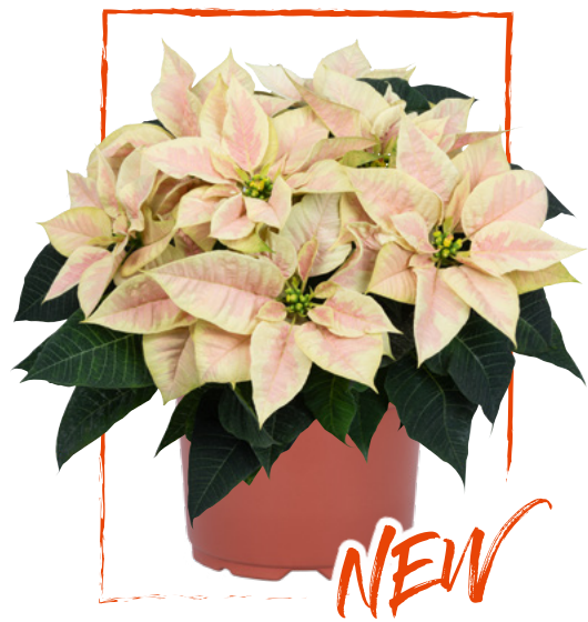
Embla Marble | 11120 8.5 weeks