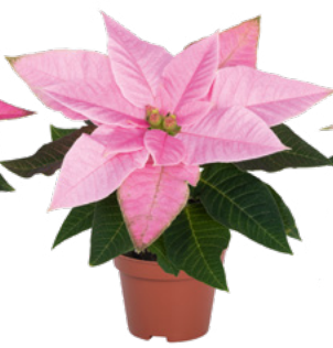
J'Adore Pink | 10381 7 weeks