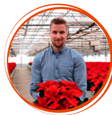
Ansari Finland Ferrara

De Roose in Belgium blooms with Imperial Poinsettia—perfect for our climate and production on concrete floors. Its reliability and desired plant structure make it our top choice.