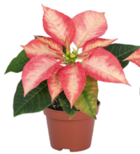
Premium Ice Crystal | 10244 7.5 weeks