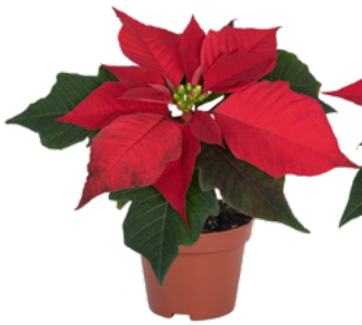
Redlight Bright Red | 10182 8 weeks