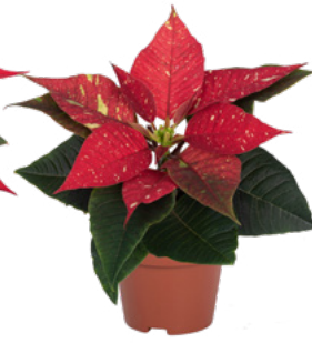
Matinee Glitter | 10153 8 weeks