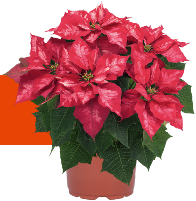
Early Polly's Pink | 11055 8 weeks