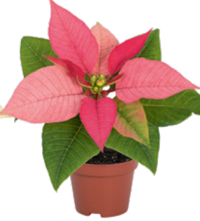
Premium Lipstick Pink | 11423 7 weeks