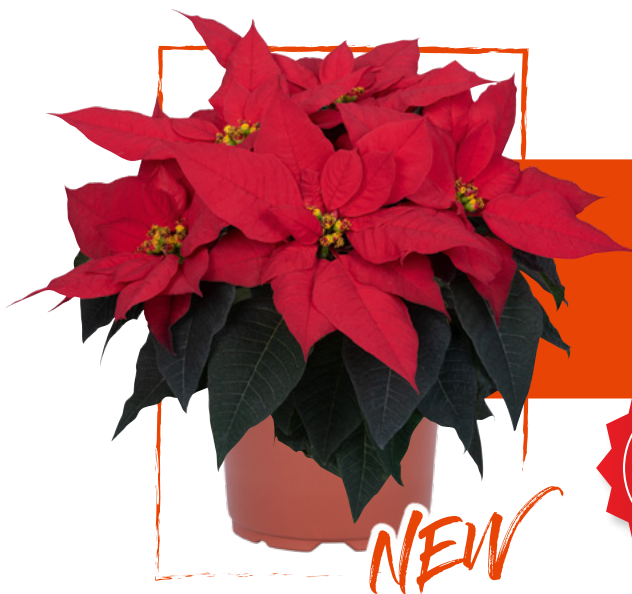
Thor | 11014 7.5 weeks