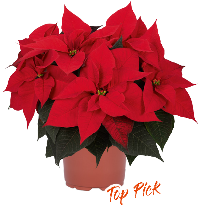
Imperial Red | 10143