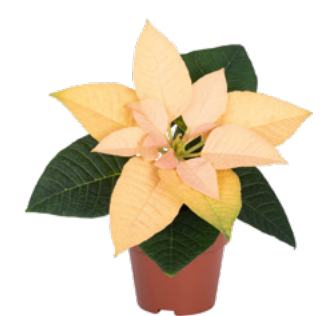
Autumn Leaves | 11326 7.5-8 weeks