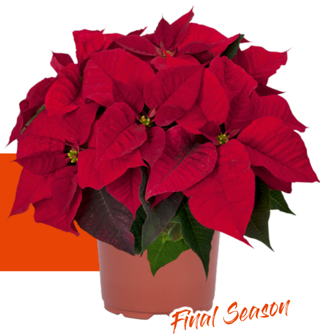
Ouverture Dark Red | 10831 6.5 Weeks