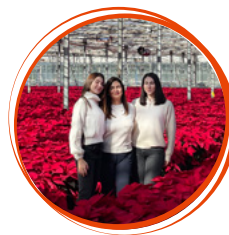
Agricola Vivaio di Luzzi Cosenza Italy Grande Italia

Ansari in Finland flourishes with Ferrara Poinsettia—perfect color for big pots, striking and of outstanding quality. This variety is a true eye catcher!