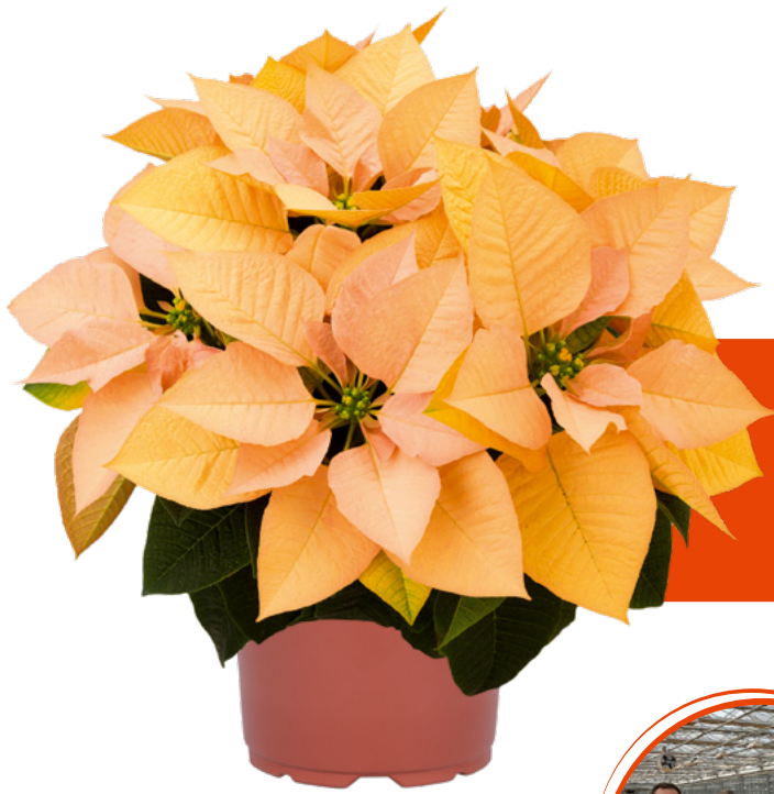
Autumn Leaves | 11326 7.5 - 8 weeks