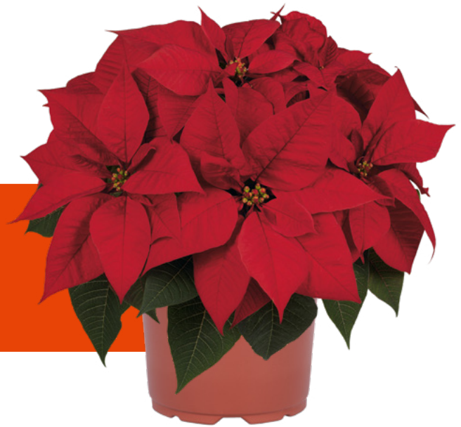
Viking Red | 10650 8 weeks

Raska in Poland grows Bravo Bright Red and Embla Poinsettias on benches, fitting our specific needs and ensuring successful production in the Polish market. Embla has a slightly later reaction time, but has still a nice vigor without to much PGRs.