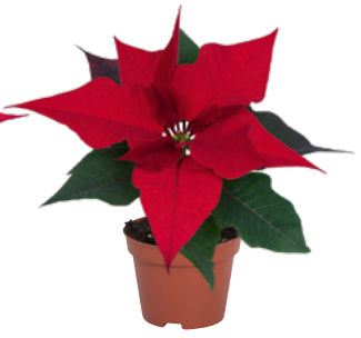
Ferrara | 10897 8 weeks