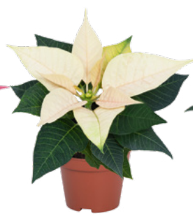
Embla White | 10378 8.5 weeks