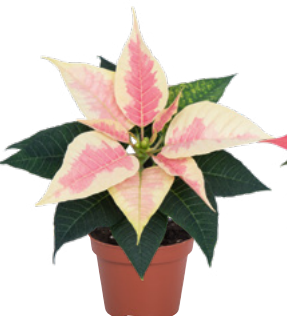
Freya Marble | 11126 7.5 weeks