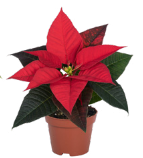
Freya | 11421 7.5 weeks