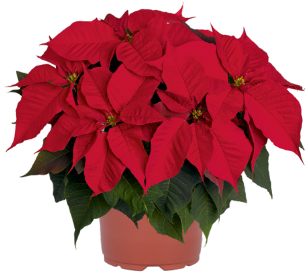
Bella Italia Red | 10610