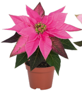
J'Adore Dark Pink | 10154 7 weeks