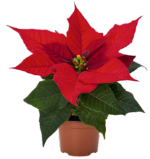
Scandic Early 2.0 | 10304 8 weeks