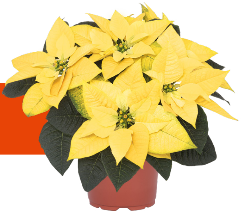
Golden Glo | 11431 7.5 - 8 weeks