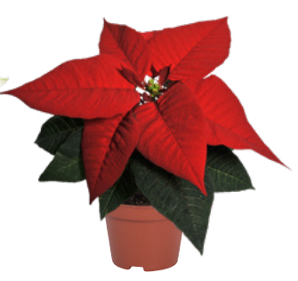
Premium Red | 10230 7 weeks