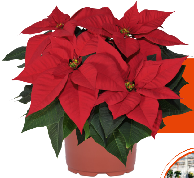
Bravo Bright Red | 10360 7.5 weeks