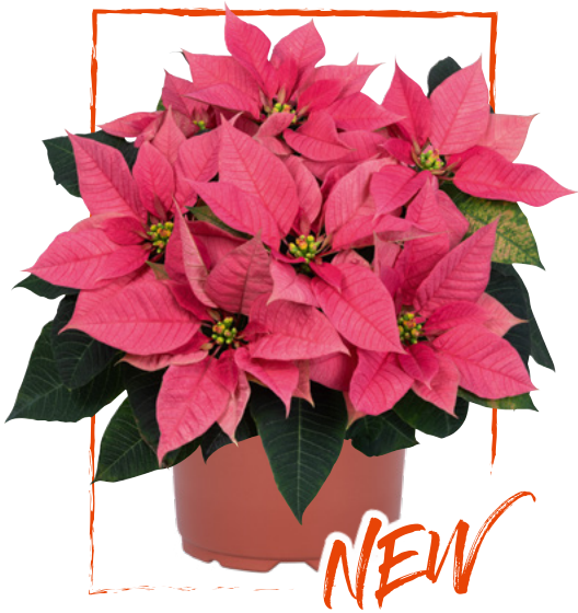
Embla Pink | 11101 8.5 weeks