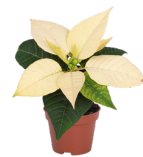
Premium Polar | 10243 7.5 weeks