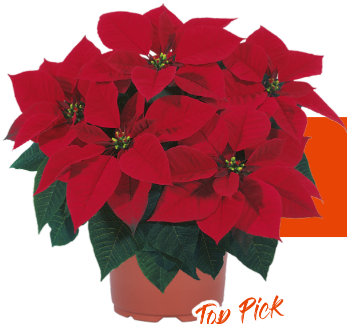
Euroglory Red | 10220 8,5 weeks