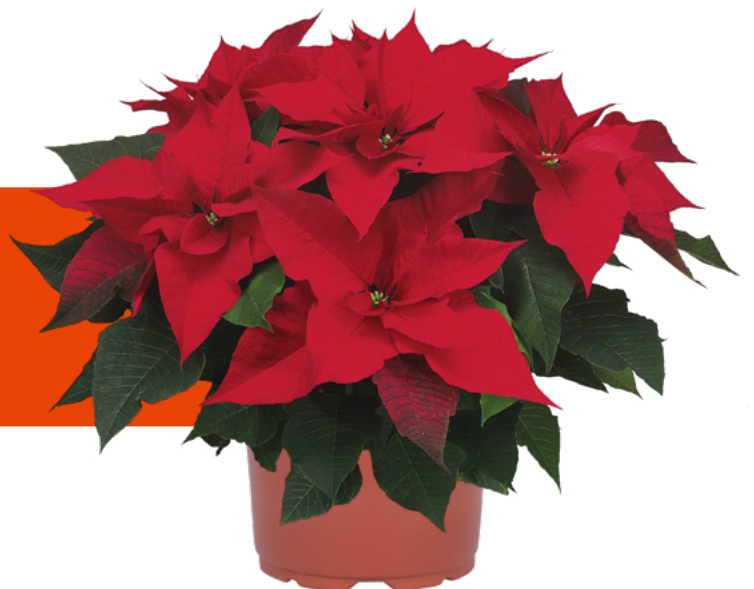
Prestige Sunrise | 11150 8,5 weeks