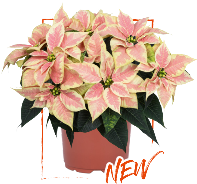
Freya Marble | 11126 7.5 weeks