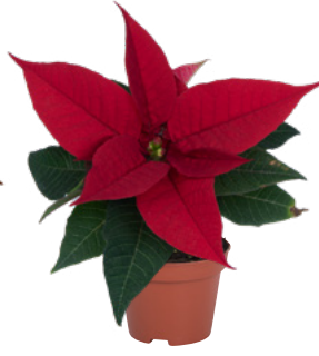
Atla | 11423 8 weeks