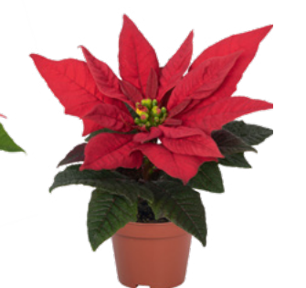
Jester Red | 10994 7.5 weeks