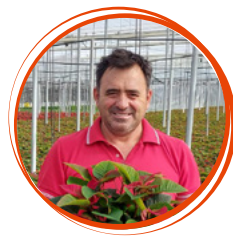
Rosaplant Spain Euroglory

Island Plants in the Netherlands achieves high-density Freya production with effective machine topping. These features are unique and suit perfectly the objectives of this valued grower.