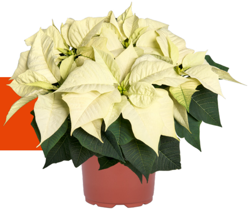
Frozen | 11056 7.5 weeks