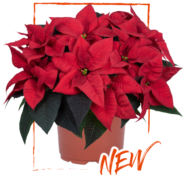
Noblesse | 11068 8 weeks