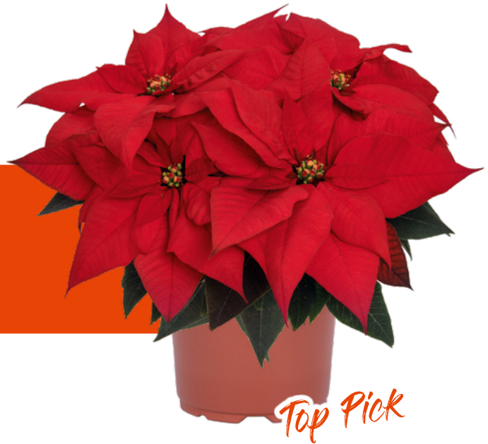
Ferrara | 10897 8 weeks