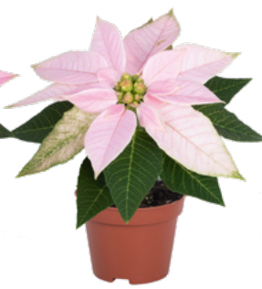
J'Adore Soft Pink | 10156 7 weeks