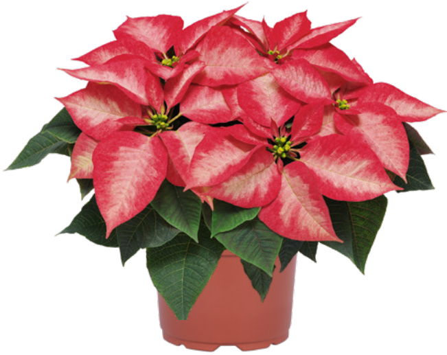
Premium Ice Crystal | 10244 7.5 weeks