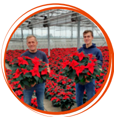
De Roose Belgium Imperial

„Den Drijver in Germany opts for Ferrara for their Poinsettia production — perfect vigor, shape, and resilience throughout the whole value chain.“