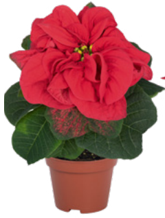
Winter Rose® Early Red | 10993 7.5-8 weeks