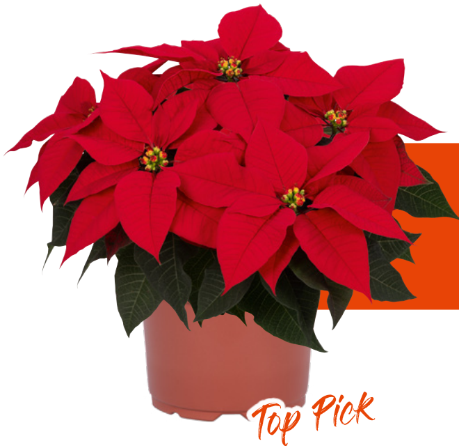
Atla | 11423 8 weeks