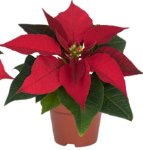
Prima Vera | 10881 8 weeks