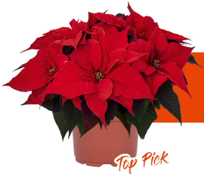
Grande Italia | 10330 8 weeks