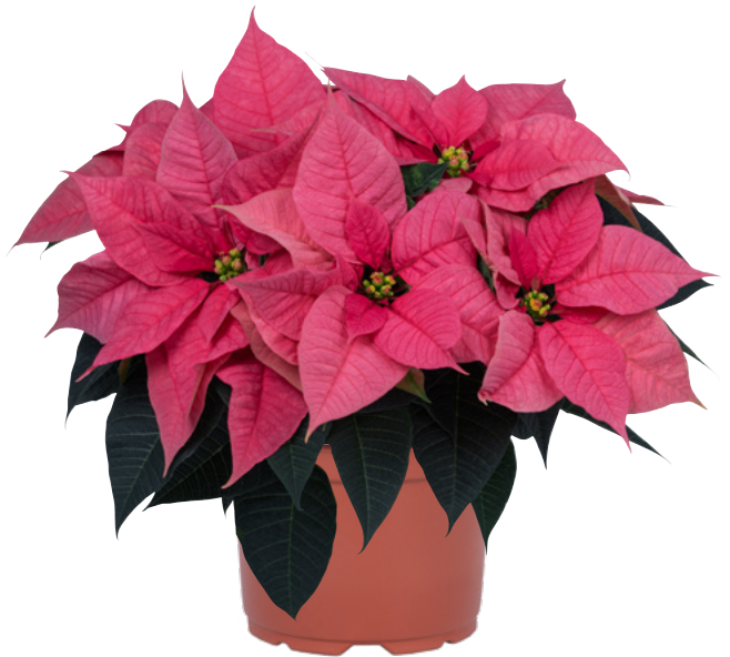
Freya Pink | 11057 7.5 weeks