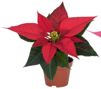
Embla | 11420 8.5 weeks