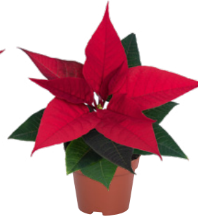
Noblesse | 11068 8 weeks