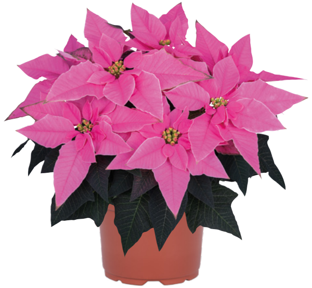
J'Adore Pink | 10381