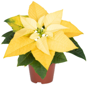
Golden Glo | 11431 7.5-8 weeks