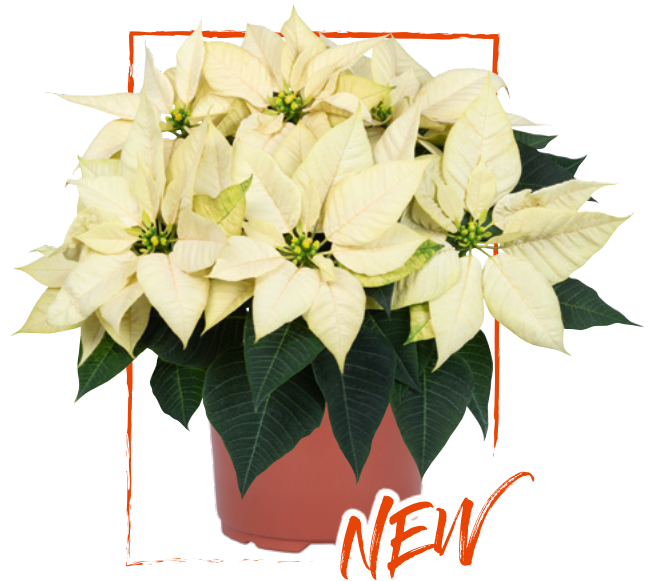
Embla White | 10378 8.5 weeks