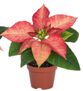
Premium Picasso | 10234 7.5 weeks