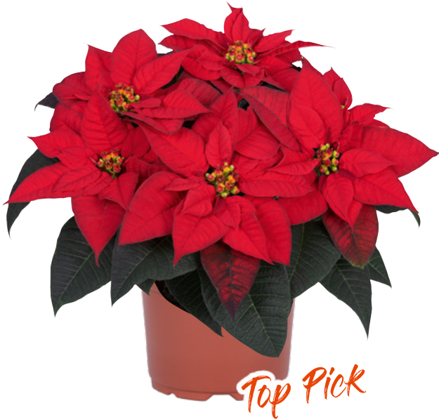
Freya | 11421 7.5 weeks