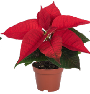
Imperial Red | 10143 8 weeks