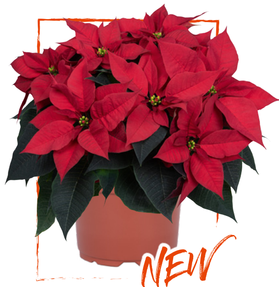
Nordic Star | 11087 7.5 - 8 weeks