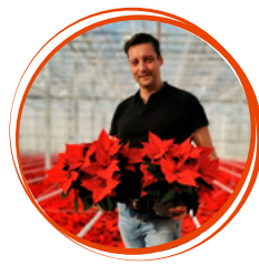
Island Plants The Netherlands Freya

Bridgefarm in the United Kingdom excels with Freya Poinsettia—ideal for the UK market, easy to pack, transport, outstanding shelflife and featuring the desired color.