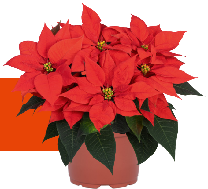
Bonfire | 11017 8 weeks